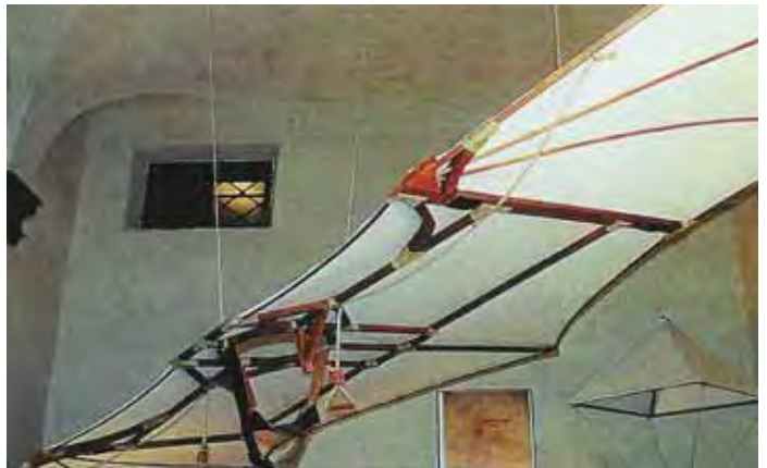
This glider is based on DaVinci's designs.

Ticket information is available at www.PalmSpringsAirMuseum.org or by calling (760) 778-6262.