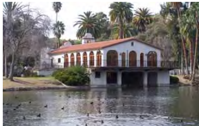
Fairmount Park in Riverside will host this year's 4th of July events, which have grown in popularity over the years and require a larger venue.

The lineup for the Summer Concert Series includes: • June 29th, Rock 'n' Roll band, Bombs and Butterflies • July 6th, Alternative band, Neon Fields • July 13th, Country band, Backseat Rodeo • July 20th, Jazz band, The Derrick Edmondson Band • July 27th, Oldies band, Latin Express • August 3rd, Blues band, A 3rd Degree • August 10th will be