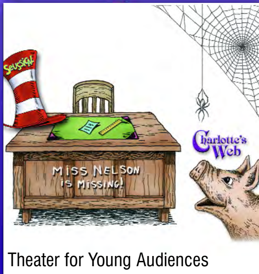
Theater for Young Audiences