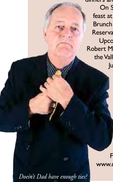
Doesn't Dad have enough ties?

For more information, please visit www.citruscitygrille.com .