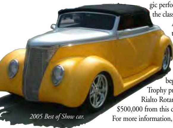
2005 Best of Show car.

Friday night's The Answer Band brings their special brand of rock 'n roll to the show. This group has become a cult fixture at many car shows, with nostalgic performances fitting in with the classic cars.