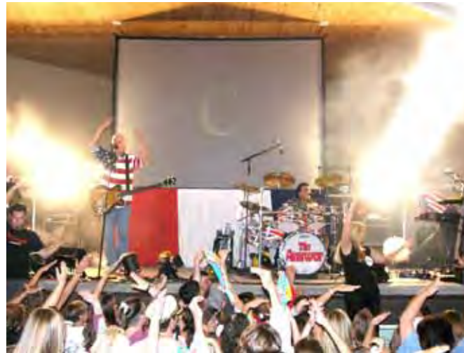
On July 3, at 5pm, The Answer takes Center Stage at Lake Arrowhead Village.