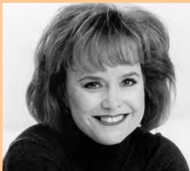
Comedian Kathleen Dunbar.

Tickets to The Comedy Stop are $12.95 and $11.95 plus tax and are available at the Flamingo Laughlin Box Office or by calling 800-435-8469.